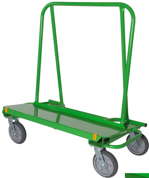
NWD-234 Drywall Cart with Removable Material Kickers

Our newest products offer the same Quality, Durability and Safety you expect from Nu-Wave with a color you can't miss on the job site!