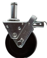
PIC-5 Elite 5" Locking