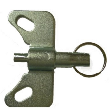
PPLR-S Position Lock