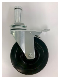
PC5B-S Classic 5" Locking Caster

Classic Models come with brackets for manual Platform positioning