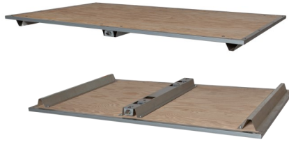
Bottom View of PP-6EL