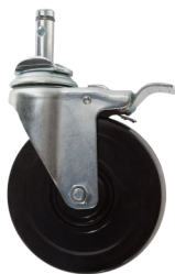
PC54B-S Step-Up Replacement Caster