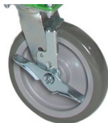
PCHTS-8-S/HD-WLK Heavy Duty Caster w/Wheel Lock