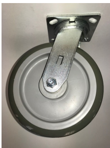
PCHTS-8-S/HD Heavy Duty Caster

Comes in Nu-Wave Green — Easily Distinguishable